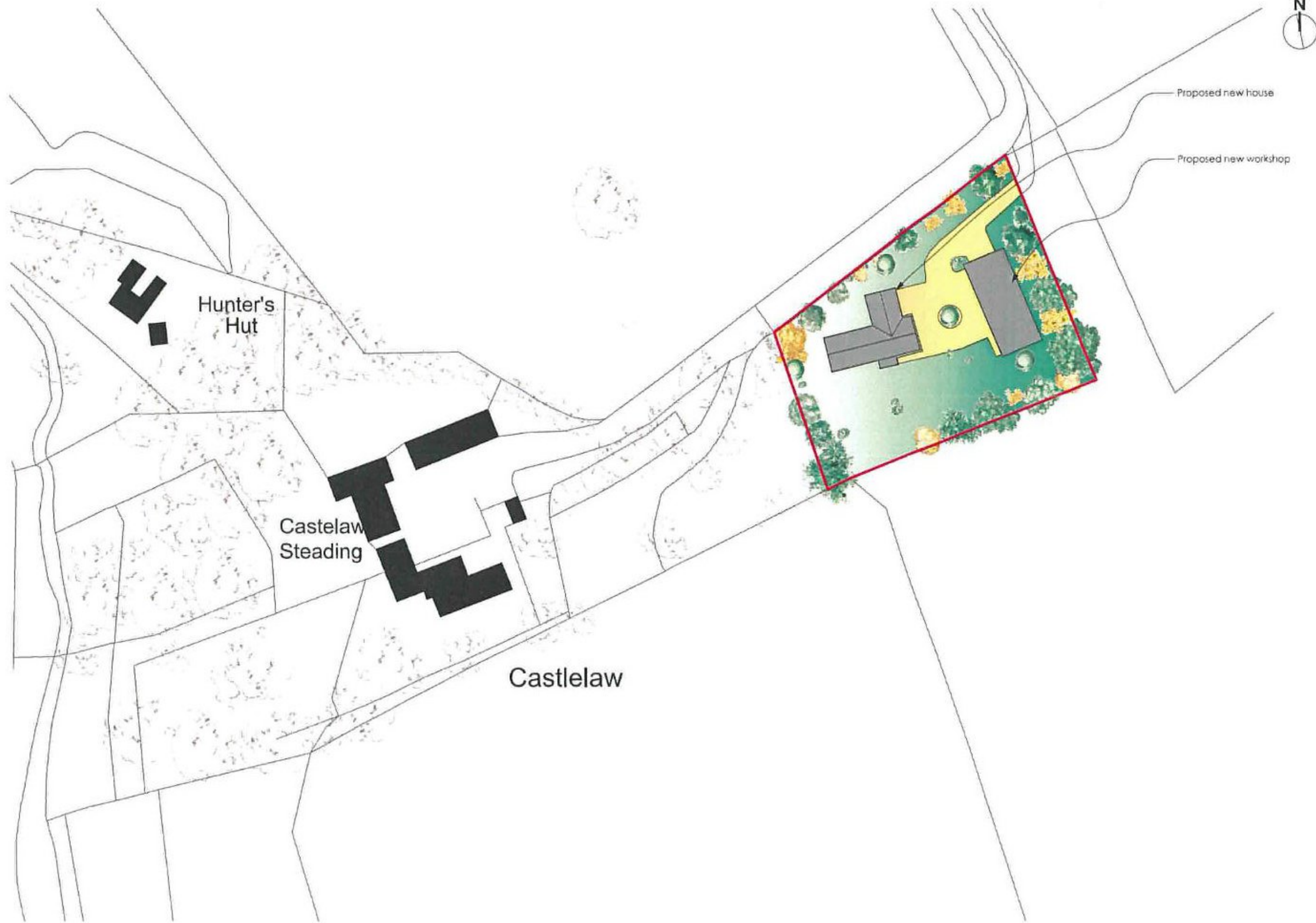
4 Proposed Site layout Scale: 1:500

subject to the requirements of the associated Decision Notice